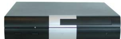
Front view of seclP220

SL60 is designed for outdoor links. It is typically installed on top of buildings. But the Ethernet connection to the SL60 is not encrypted. The seclP220 encrypts the data transmitted from inside a building to another safe environment in the opposite building. SL60 combined with seclP220 guarantees optimal data security.